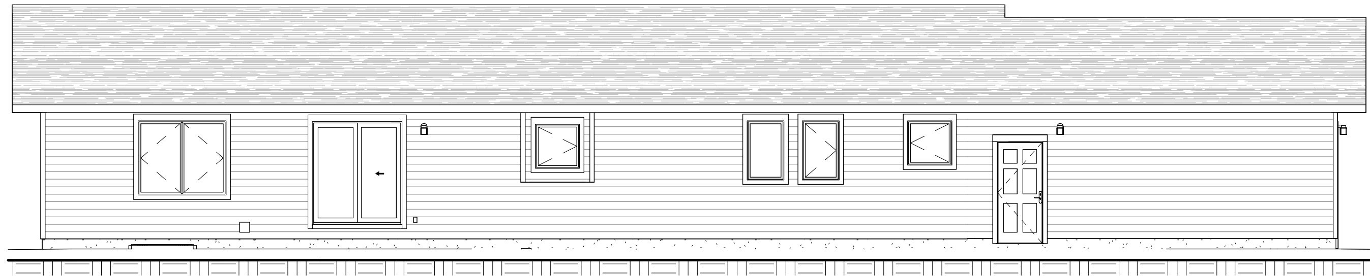
② Rear 1 : 78