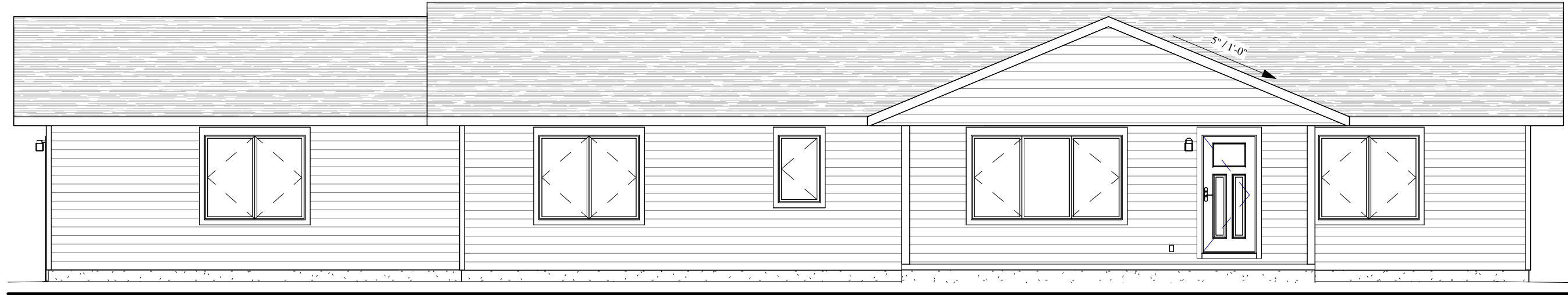
① Front 1 : 78