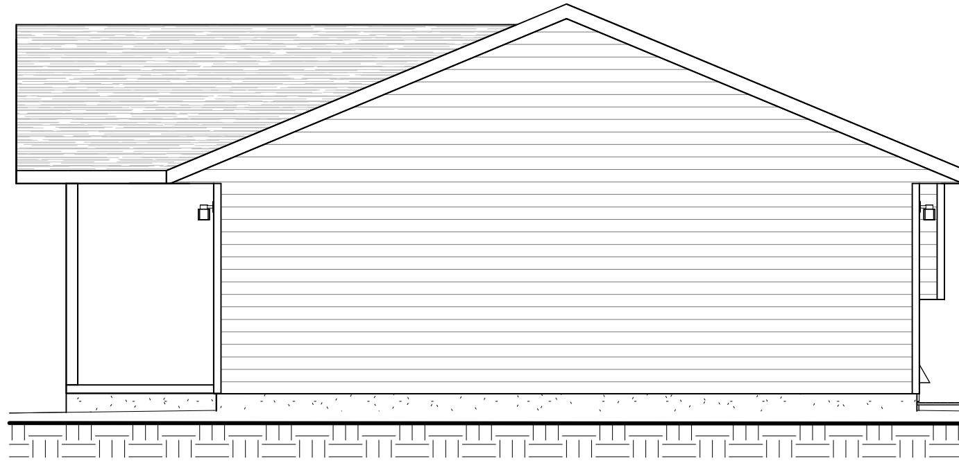
② Right 3/16" = 1'-0"