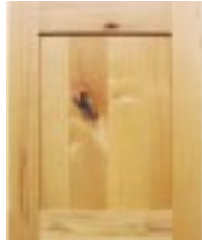
Wardcraft has over 45 cabinet choices pictured in its 116 page catalog. Knotty Alder shown.