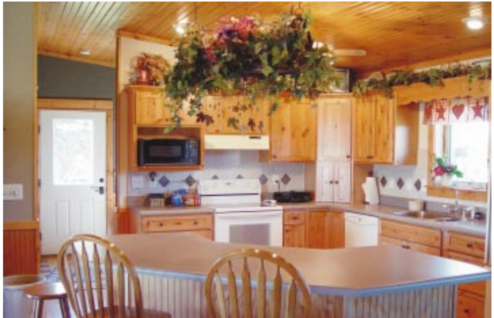
Add a warm and unique feel to your home with beaded pine T&G or pine V-groove ceilings.