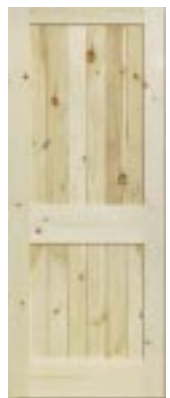
Wardcraft has 19 interior door options such as flat panel v-groove (above) in unique wood species such as knotty pine, knotty alder, hickory, maple, oak, cherry and knotty red cedar.

10. Wardcraft purchases materials at a higher volume discount than on-site builders, translating in to savings for our customers. Volume buying also allows us to pick and choose materials, refusing lumber and products that are not up to our stringent standards.