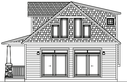
Side Elevation with Full Vault