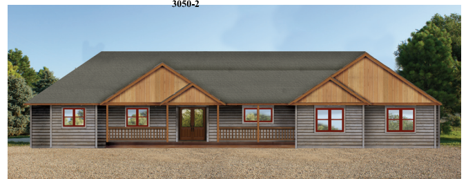
This home is designed to have the garage, two bedrooms and study built by Wardcraft and delivered to your job site, eliminating the need to build your garage on-site.

This home's foyer leads into the expansive living room with fireplace. The dining room, with a 9' patio door, is open to the kitchen and living room featuring post and beam detail between the living and dining rooms. The gourmet kitchen includes an oversized island. The master suite features a large walk-in closet, double sink vanity, whirlpool bath and 5' shower with dual showerheads. Two additional bedrooms with walk-in closets, an office and study complete this home.