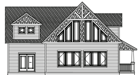
Side Elevation with Full Vault